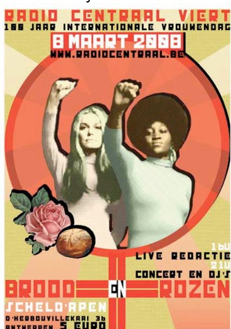
Figure 3: Poster/Flyer of Radio Centraal celebrating 100 years of international women's day

Belgian media regulator, which has the power to sanction radio stations, recently condemned Radio Centraal for boosting its signal beyond the strict limits set by the law, but reduced its penalty because of the specific nature of the station (Vlaams Commissariaat voor de Media 2005). This amounted to a first – albeit implicit – official regulatory recognition of the distinctiveness of community radio in the North of Belgium.