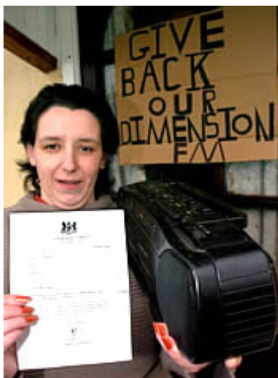
Figure 2: Protest against the raid on Dimension FM (UK)