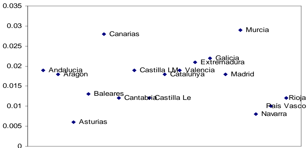
Figure 1. Income-related Inequities in Health by AC

Navarra=Navarre, País Vasco= the Basque country, Castilla Le=Castile Leon, Baleares=the Balearic Islands, Catalunya=Catalonia, Castilla LM=Castile la Mancha, Andalucia=Andalusia, Canarias=the Canary Islands,