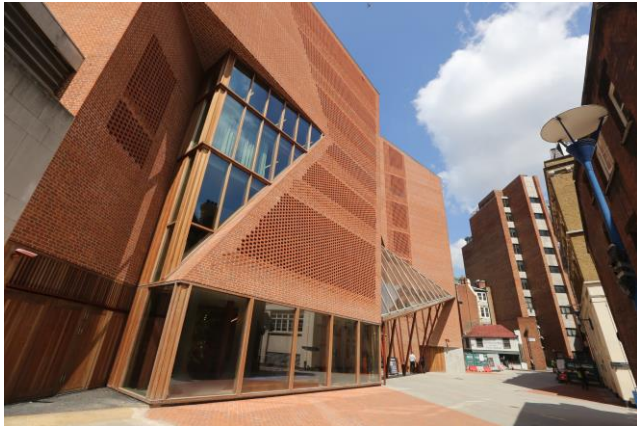
Pedestrianised entrance to SAW