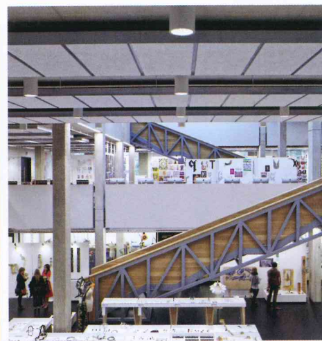
HUFTON + CROW

Client · Manchester Metropolitan University Contractor · Morgan Sindall Contract value · £23.6 million Gross internal area · 17,320m 2 Region · North West