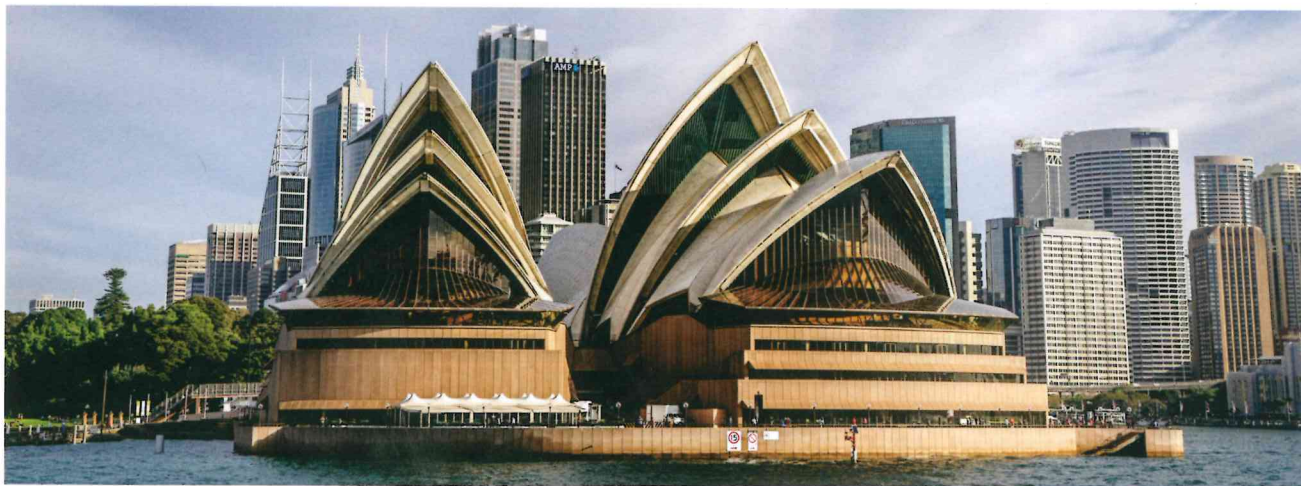
Built up aria: Utzon's Sydney Opera House

of estates at LSE and deputy chair of HEDQF, was able to announce at the start of the conference that 'we think we have perfected design competitions. Other universities have asked us how we do it, and we thought we would share some of our secrets.'