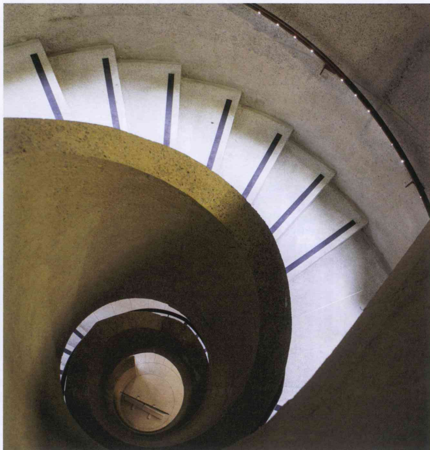
Going up in the world

'No! We are the London School of Economics! And that's an incredibly powerful element of our brand. You come here and you know you are in London. We are a key stop-off point for world leaders and finance ministers. With great respect they are not going to come out to Ealing or the Greenwich Peninsula. That is why we have spent such a lot of money in buying real estate around here to set down our roots.'