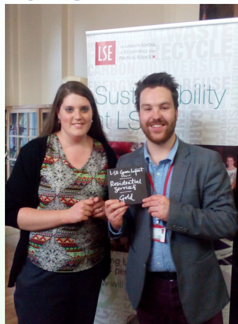
Residences picking up their gold award