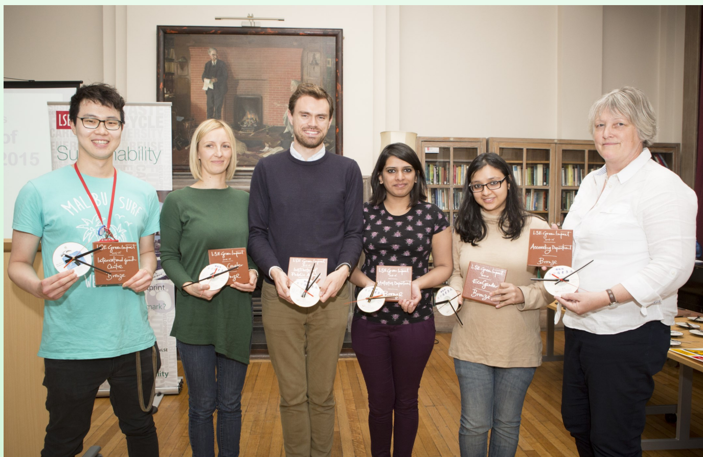
Bronze winners collecting their tiles and clocks