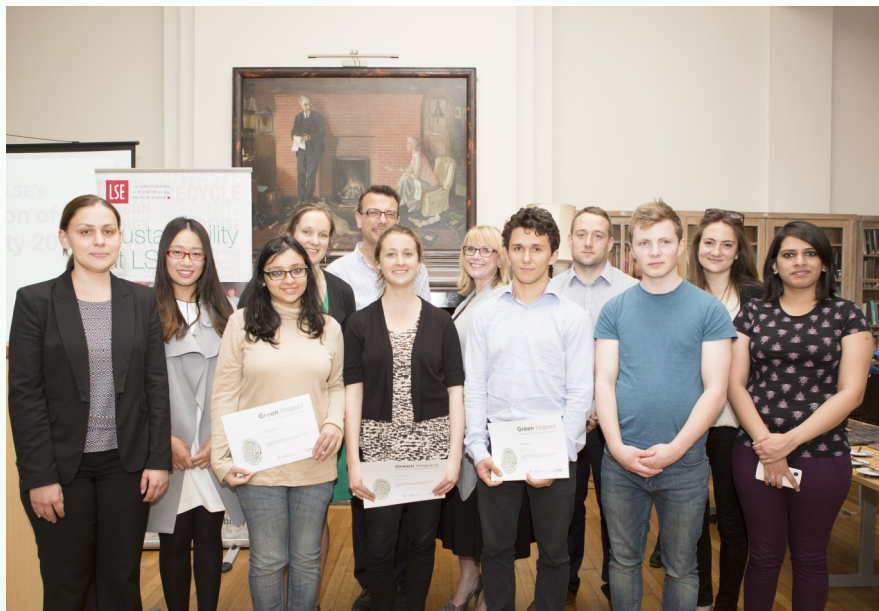
Staff and Student Green Impact auditors