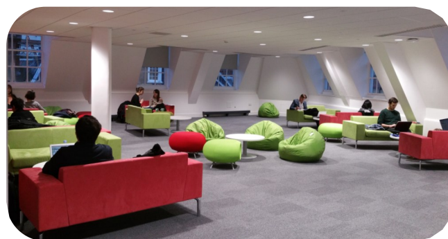
LRB, 4th floor PhD Academy

architect to design our latest development on 44 Lincoln's Inn Fields (the Paul Marshall Building). In the summer we will be targeting the release of a School wide Accommodation Plan, which will give a clear indication of where all departments, research centres and divisions will be located over the next ten years. A major focus of the work of the Estates Division both in respect of Capital Development and Facilities Management will be strengthening and enhancing the student experience particularly in terms of the teaching and learning environment. What we do, the environment we create and how we treat them, really matters to students. As they are now the main funder of higher education and effectively pay our wages it is essential we ensure our customer service is second to none.