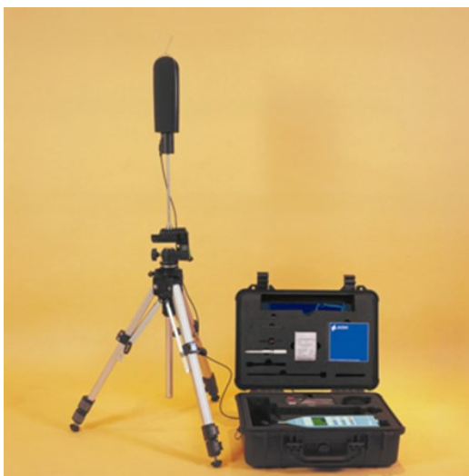
Typical Noise Monitor