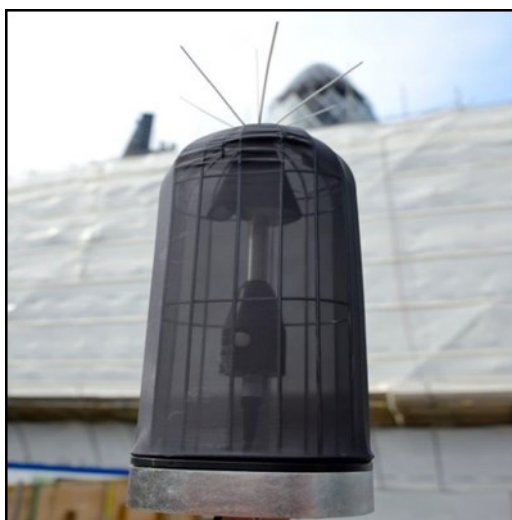
Typical Dust Monitor

This technology samples in line with Local Authority air quality guidance