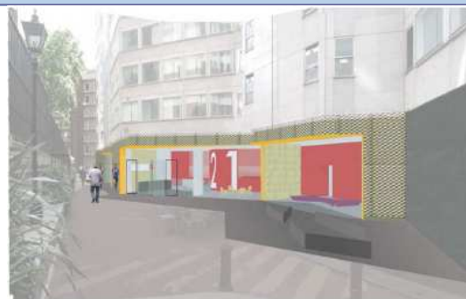
Towers Reception Project

http://www2.lse.ac.uk/intranet/LSEServices/estatesDivision/buildingAndConstruction/Summer-works-2012.aspx