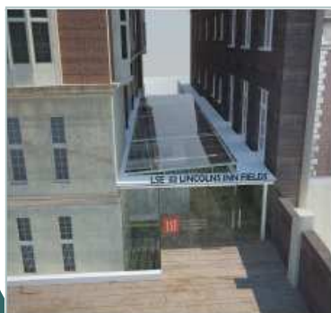
32 Lincoln's Inn Fields New Side Entrance