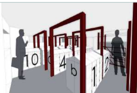
New Locker Room-Old Building