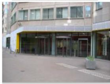
CLM – Clement House