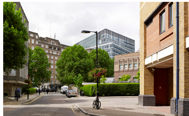
Existing North Elevation