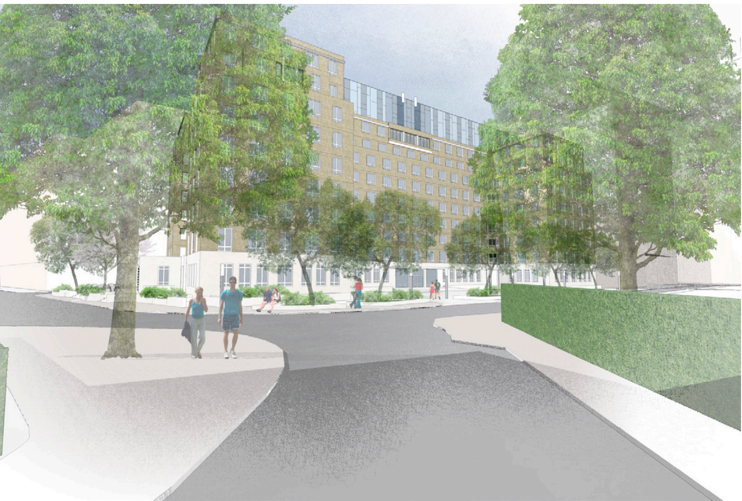
Proposed View from Park Street

The original plans to put accommodation in the basement are not now being pursued but the re-landscaping and removal of the parking to Sumner and Great Guildford Streets also affords the opportunity of the existing café extending out into Great Guildford Street with direct access. The basement area, by rationalising and removing the car park, is being extensively modified to improve student amenity and study facilities and also to create 190 bike parking spaces on site, combining learning and living to further enhance the student experience. Car parking is being reduced to those spaces located in the building entrance forecourt, which are for staff and those with disabilities, and will be carefully managed.