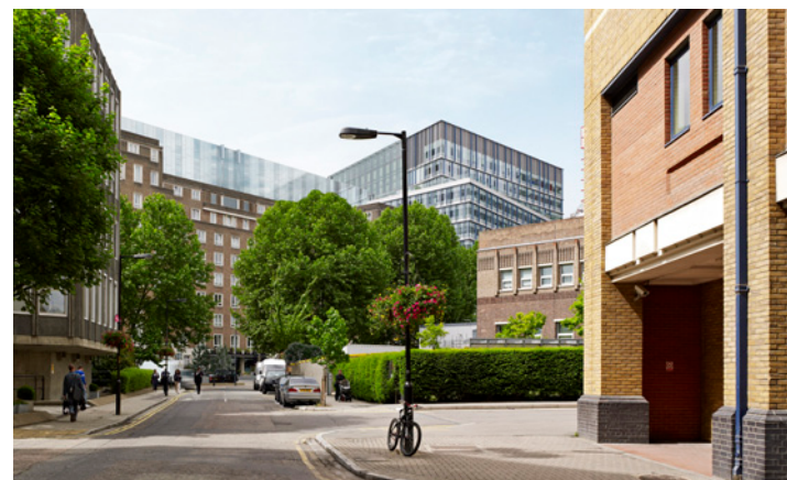
Computer Generated Image of the North Elevation