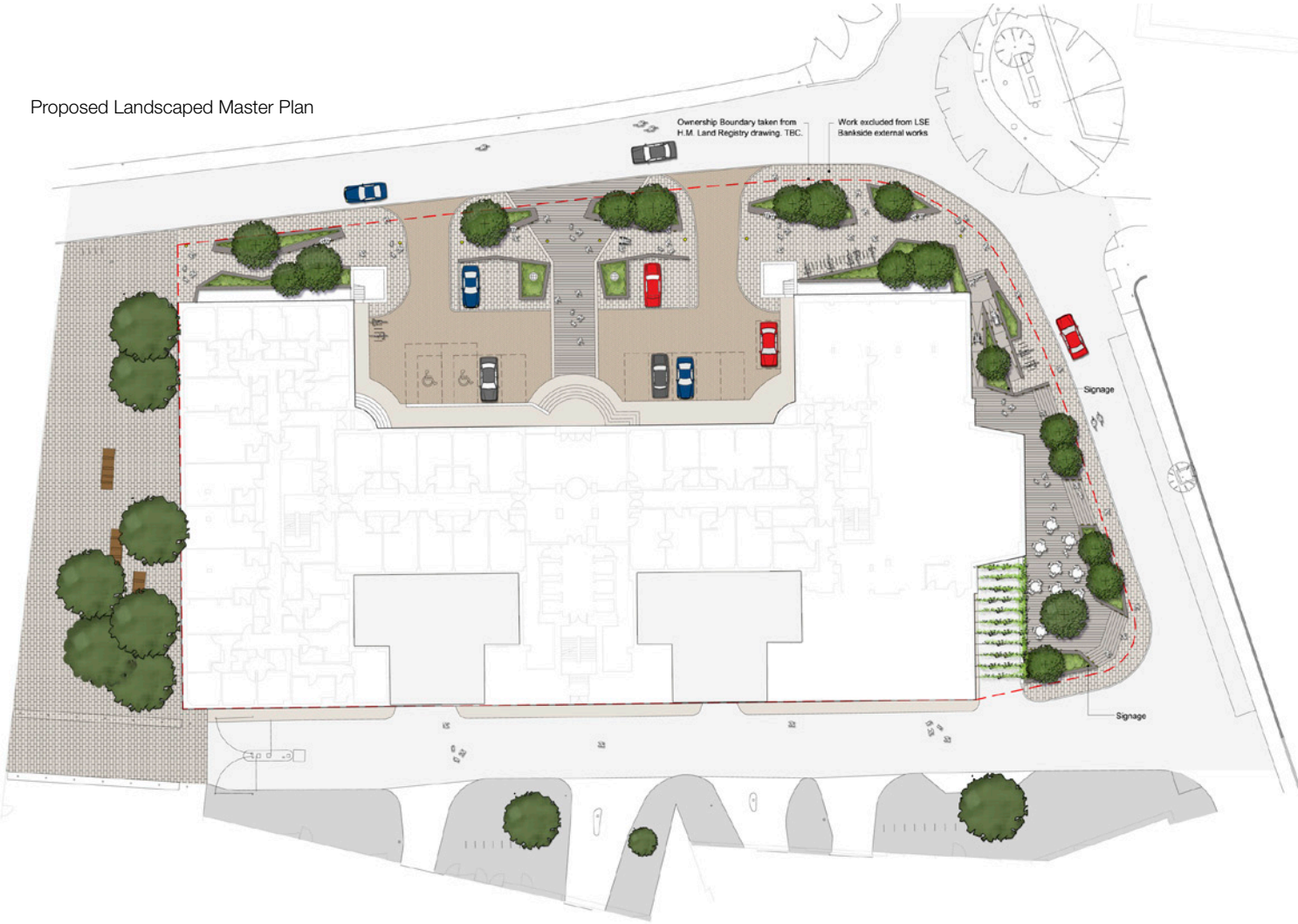
Proposed Landscaped Master Plan

and enhance the pedestrian routes around the Tate Modern extension with further landscaping in line with the Urban Forest Proposals. An indicative image of these plans is provided below. There is also provision in the Section 106 contribution for the Council to make public realm improvements ideally to Canvey Street to the west of the site.