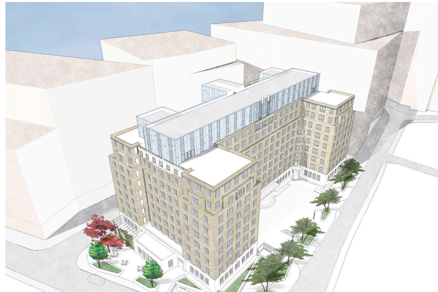
Sketch View of the Proposed Building Form from the North East