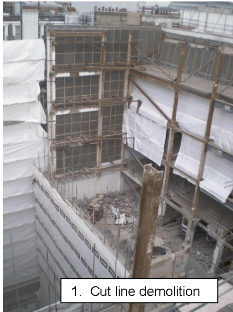
1. Cut line demolition