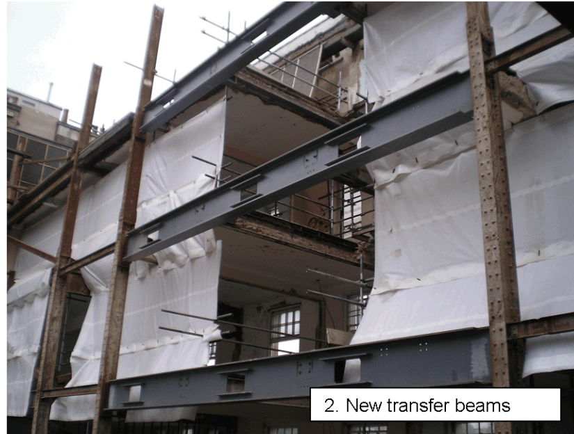
2. New transfer beams