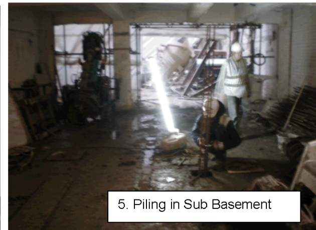
5. Piling in Sub Basement