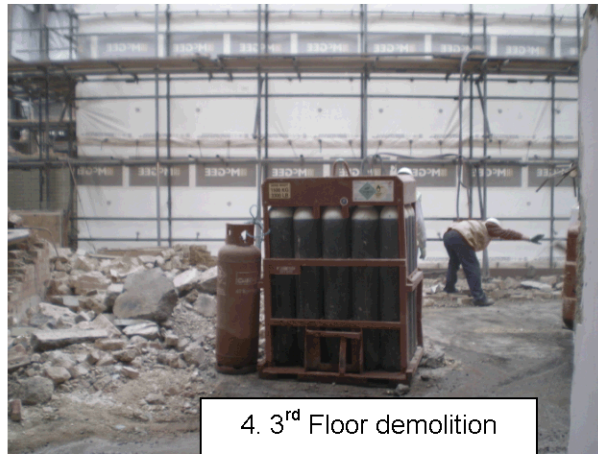
4. 3 rd Floor demolition