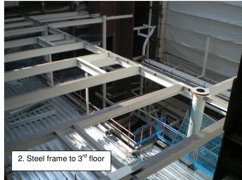
2. Steel frame to 3 rd floor