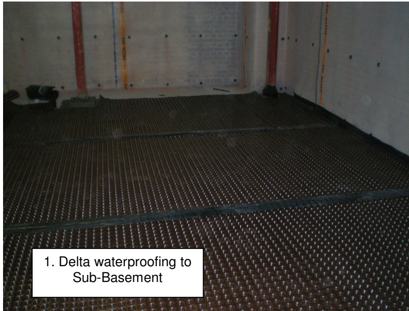
1. Delta waterproofing to Sub-Basement