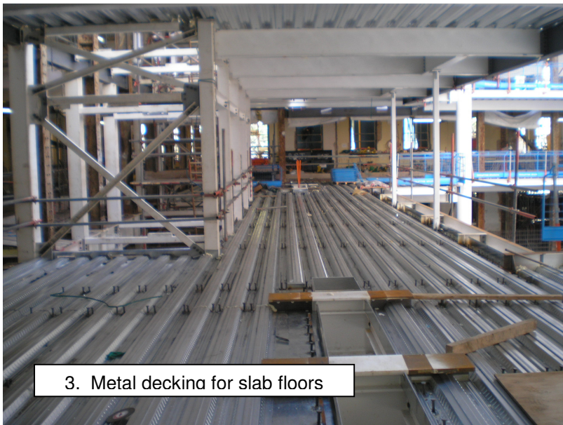
3. Metal decking for slab floors