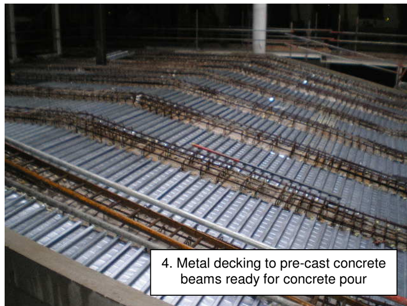
4. Metal decking to pre-cast concrete beams ready for concrete pour