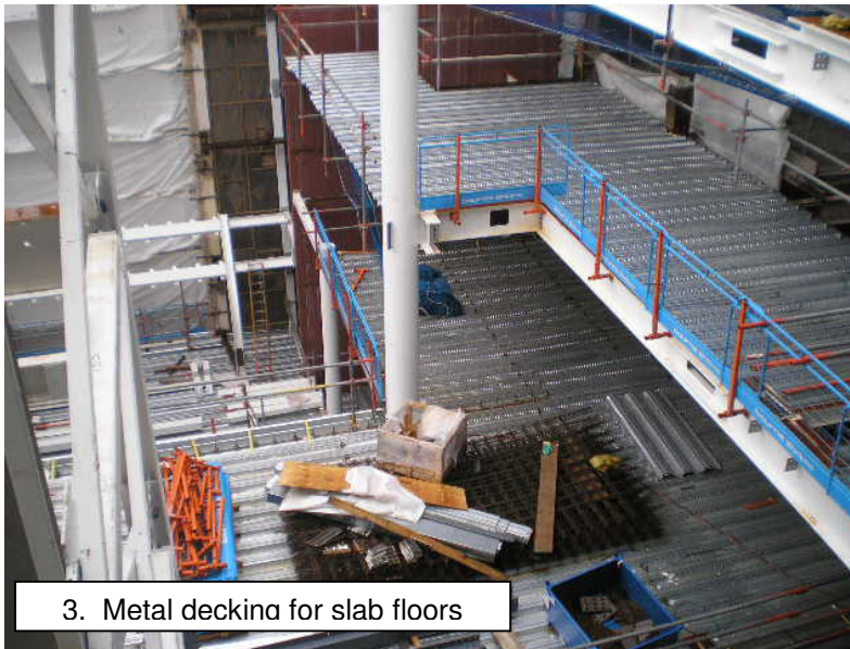
3. Metal decking for slab floors