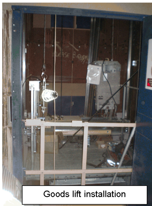
Goods lift installation