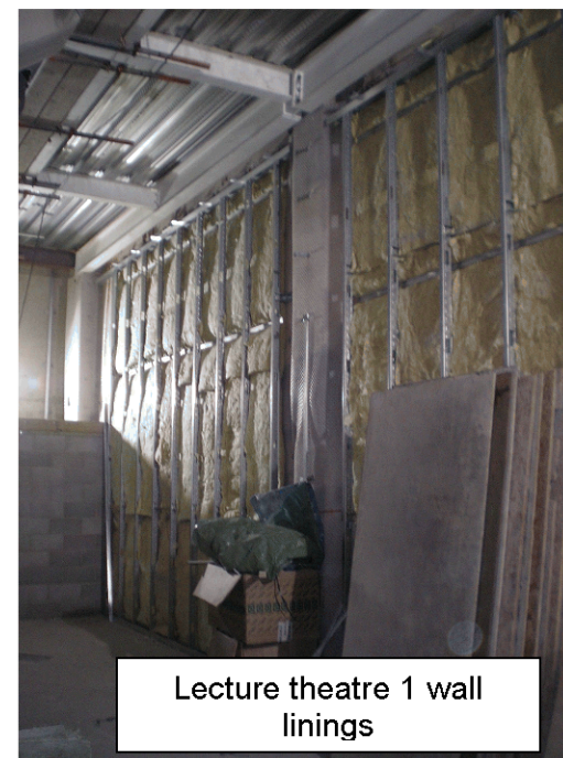
Lecture theatre 1 wall linings