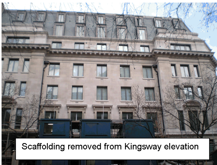
Scaffolding removed from Kingsway elevation