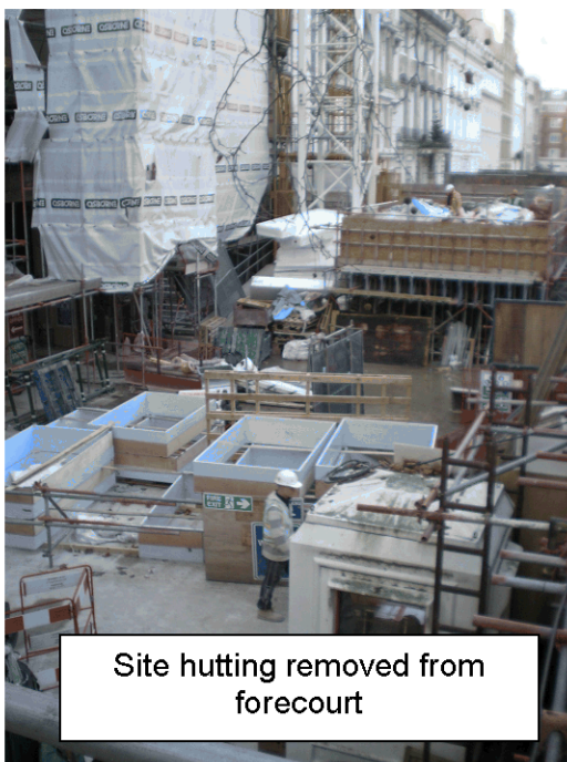
Site hutting removed from forecourt