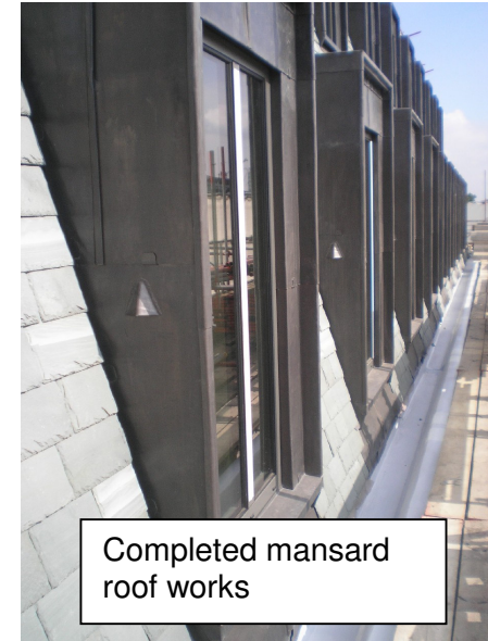
Completed mansard roof works