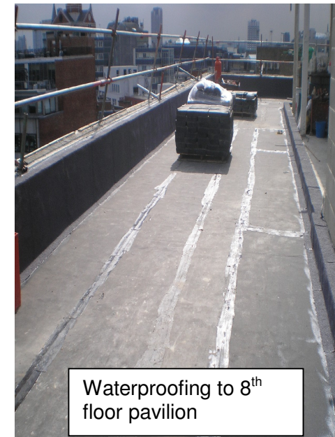
Waterproofing to 8 th floor pavilion