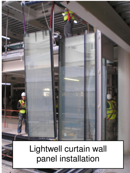
Lightwell curtain wall panel installation