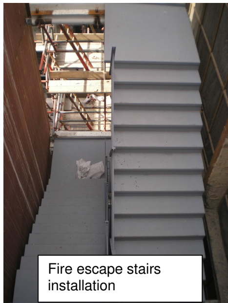
Fire escape stairs installation