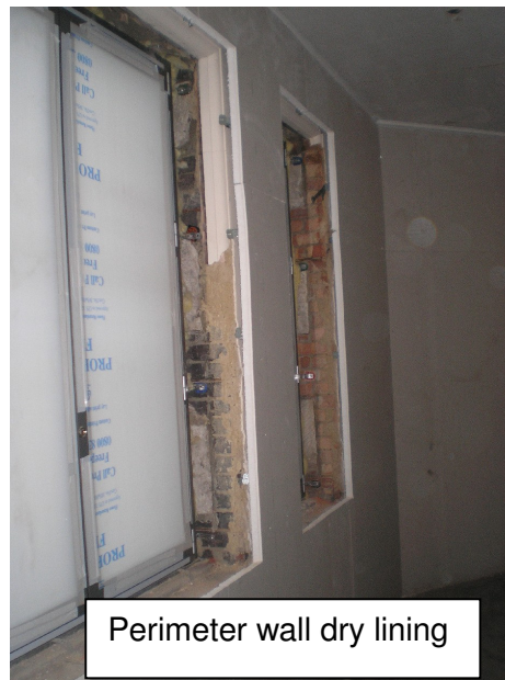
Perimeter wall dry lining