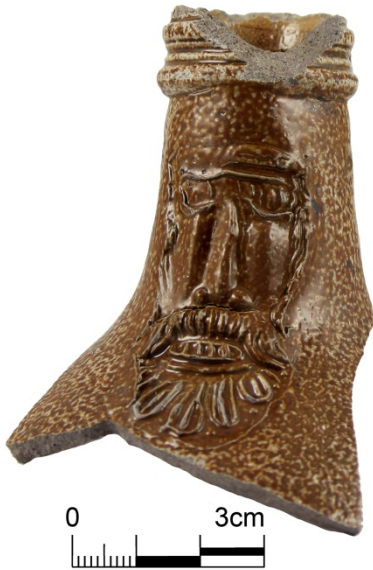
16th/17th C Bartman or Bellarmine bottle tops with decorative faces