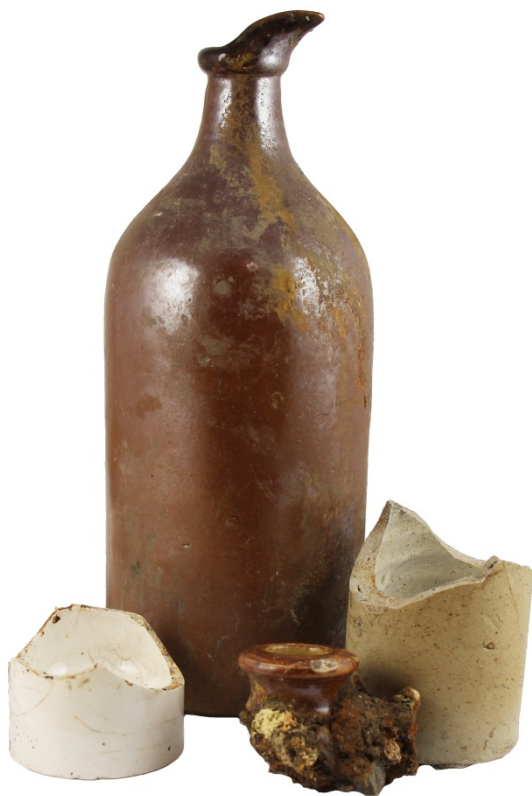
19th C Stoneware bottles including a complete ink bottle and smaller bottle base fragments.