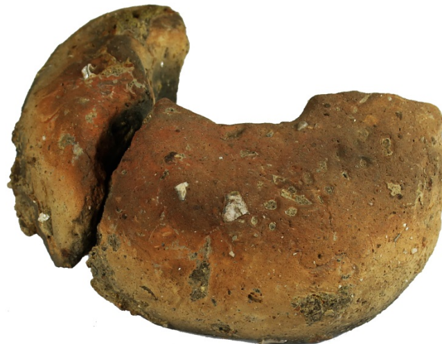
Anglo Saxon loom weight, used in textile production.