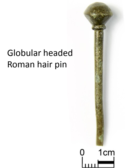
Globular headed Roman hair pin