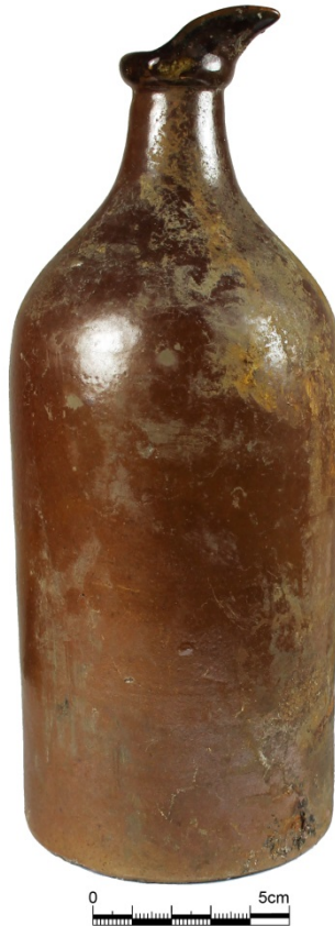
19th C Ink bottle with spout for dispensing ink into inkwells