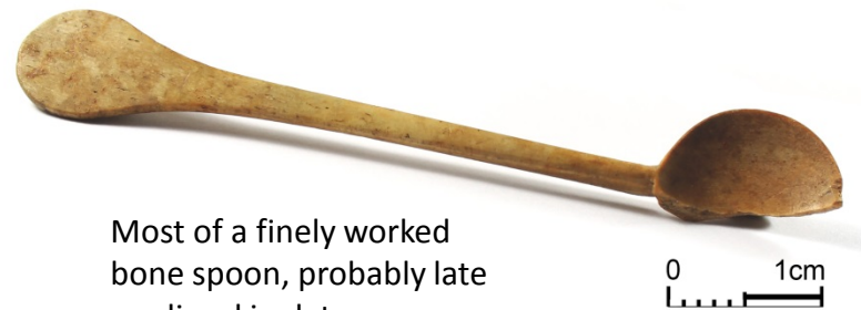
Most of a finely worked bone spoon, probably late medieval in date