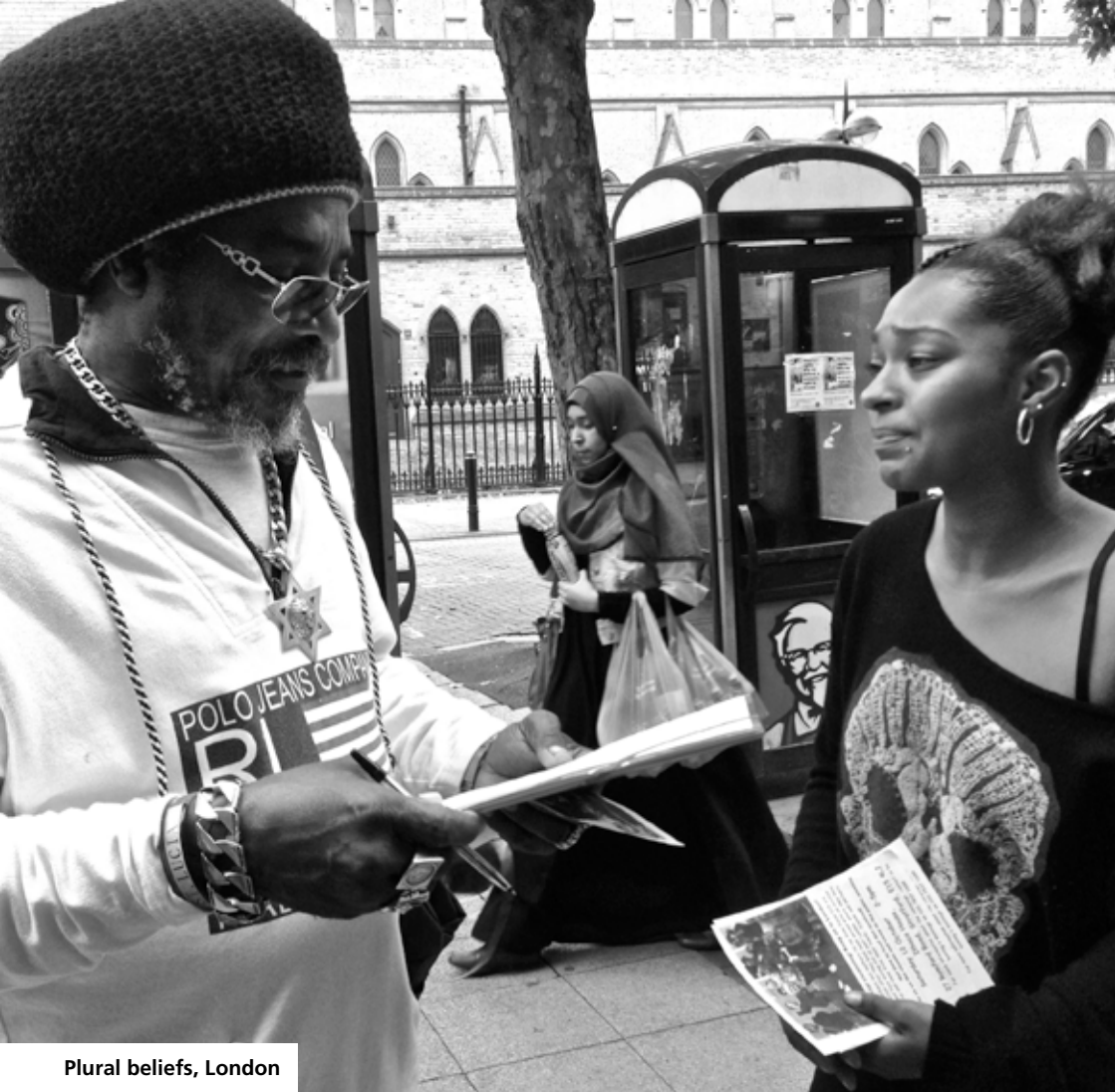
Plural beliefs, London