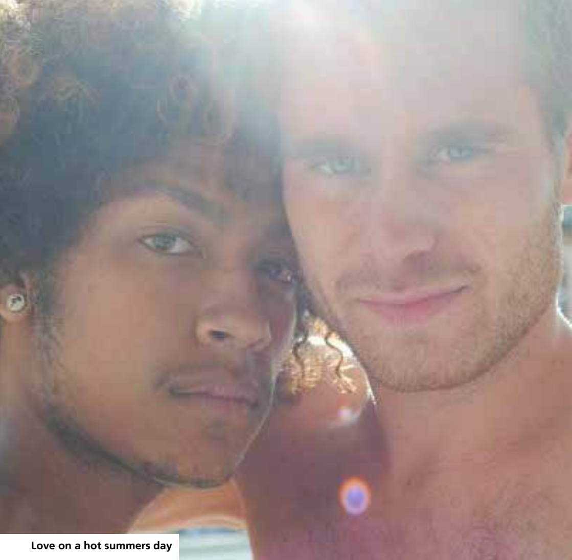
Love on a hot summers day