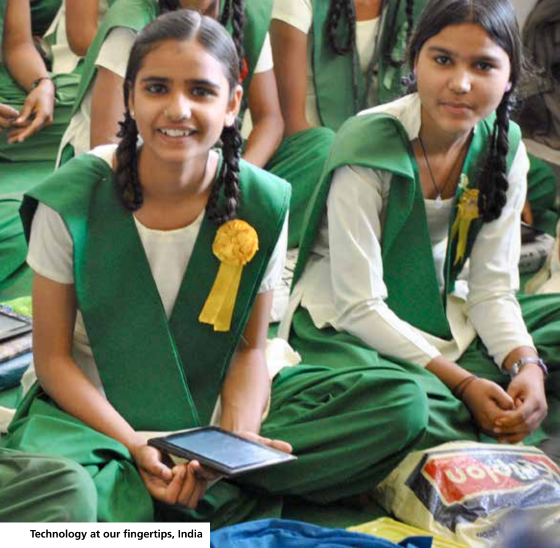
Technology at our fingertips, India