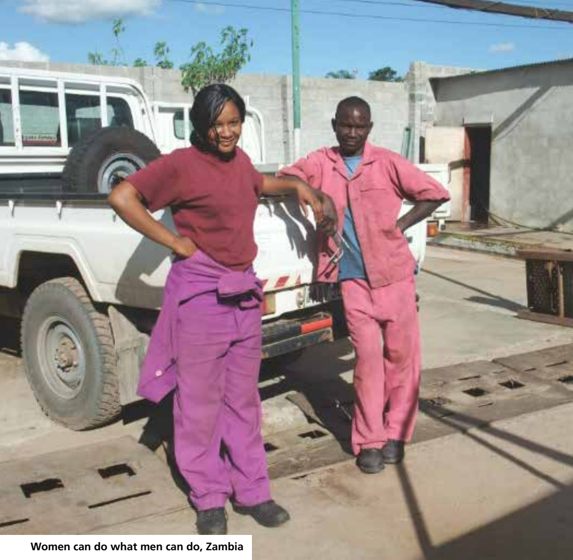
Women can do what men can do, Zambia