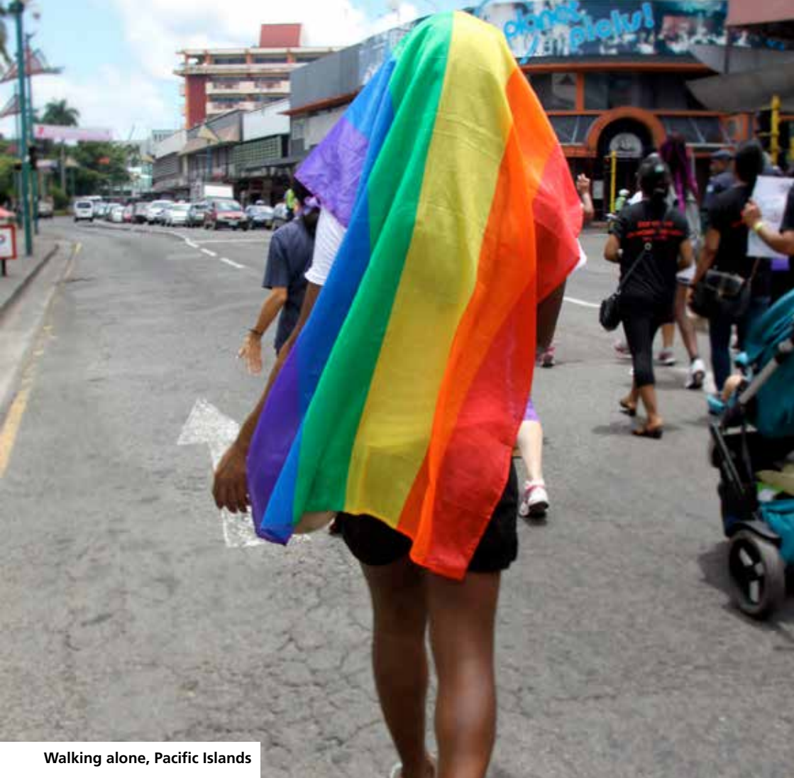
Walking alone, Pacific Islands