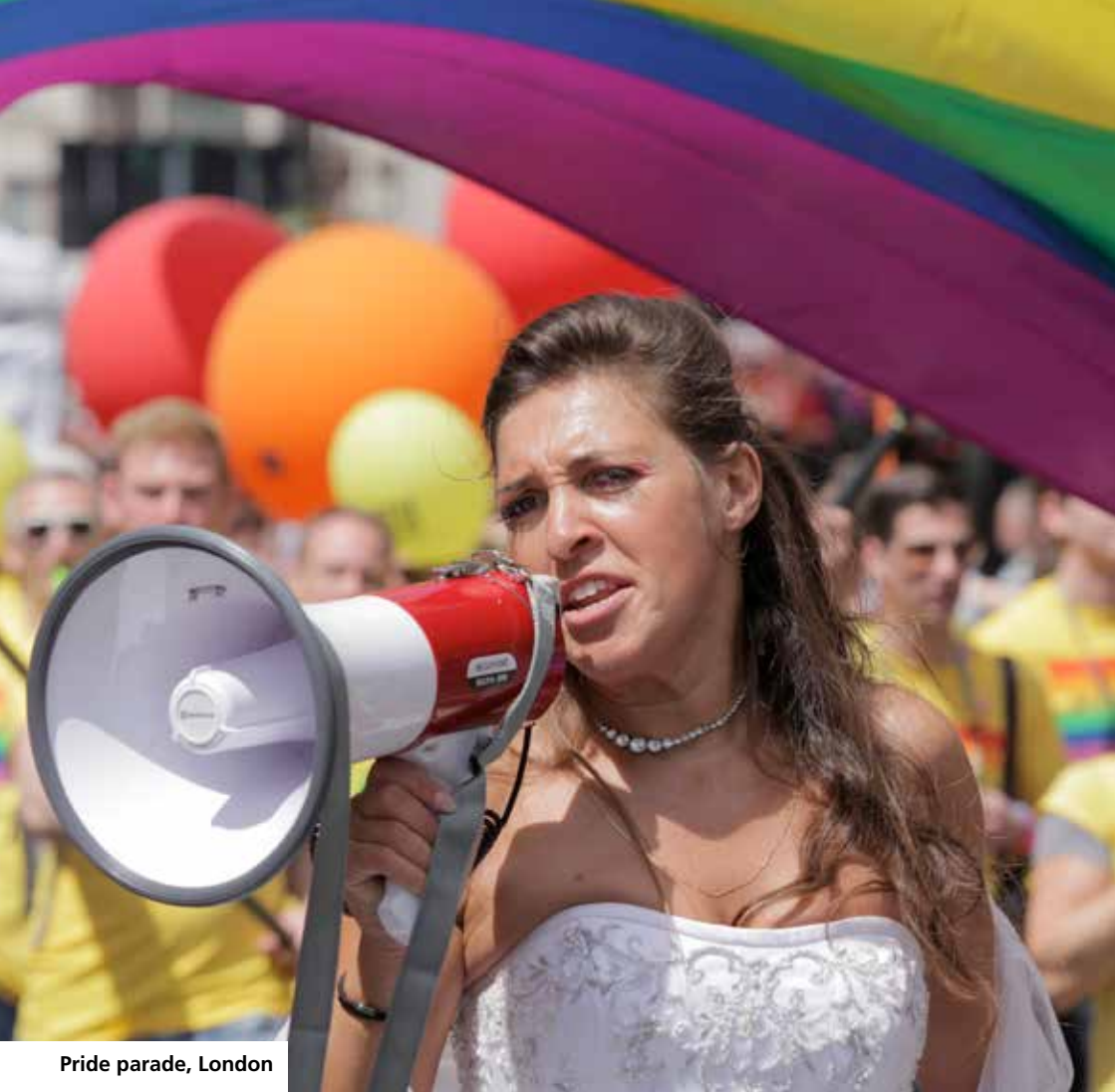
Pride parade, London

“How important it is for us to recognise and celebrate our heroes and she-roes!” Maya Angelou