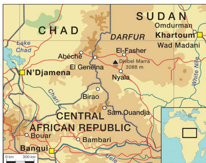
Figure 2: The tri-border region of eastern Chad, north-eastern CAR and Darfur

When examining the triangle of intersecting national boundaries in north-central Africa, it is helpful to visualise a braid. Chad, CAR and Sudan each represent a ‘thread’ that is defined not only by its borders, but more so by multiple ethnic groups, languages, traditions and beliefs. Such elements are further woven into a vast and diverse topography that ranges from dense forest and savannah in the south to long stretches of arid deserts in the north. An examination of a map of this region (see Figure 2) reveals deceptively clear state boundaries that are challenged by the reality of porous borders, which allow goods and people to travel between states, contributing to the patchwork nature of this region. Such fluidity has much significance as problems and events often reverberate across state boundaries.