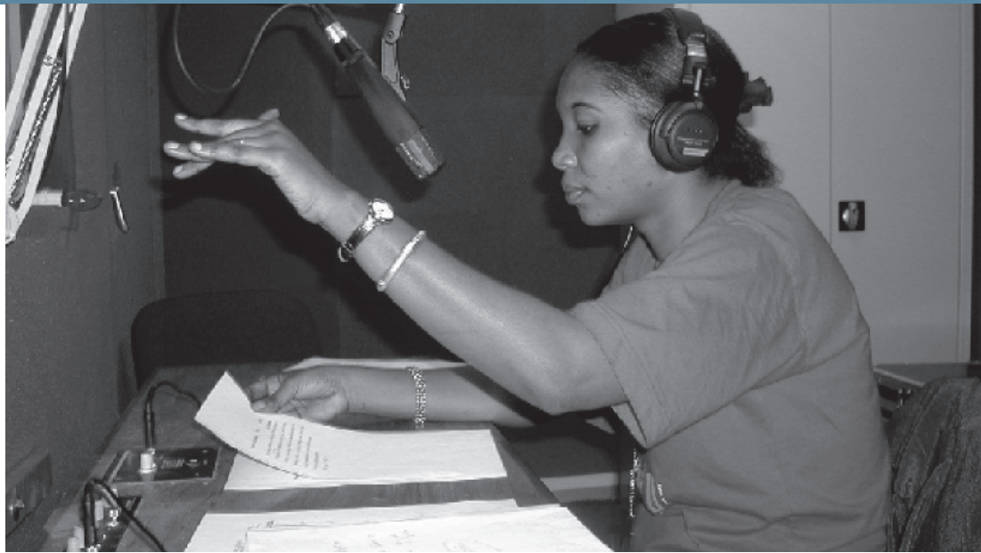
Newsreader in the DRC