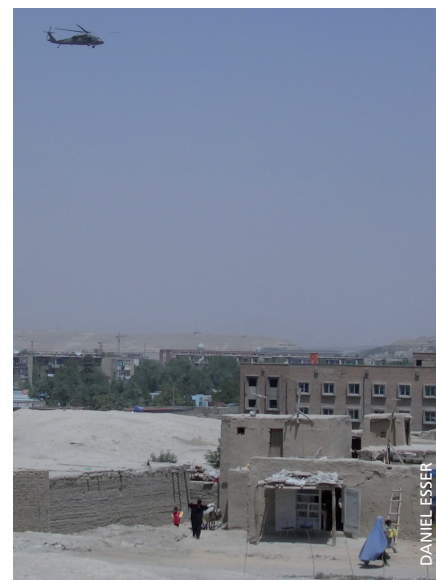
ISAF Helicopter flying over war torn Kabul