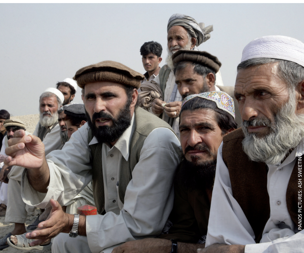
Tribal elders in eastern Afghanistan discussing land allocation at a shura, or gathering of elders

Nevertheless, ensuring basic security from armed challenges by non-state forces remains a crucial first step in any effort to recover from war and build or rebuild social, economic and political life. To date, the failure to make significant progress in building a disciplined national army in the Democratic Republic of Congo has left communities at the mercy of undisciplined soldiers from Kinshasa, the soldiers of the FDLR who were involved in the Rwandan genocide and are still ensconced in the Eastern Congo, and a myriad of armed forces that provide protection for their threatened communities while raiding and looting the villages and towns controlled by their rivals. In Afghanistan, the new national army remains far smaller than envisaged and still dependent on foreign trainers, while an array of militia groups are still relied