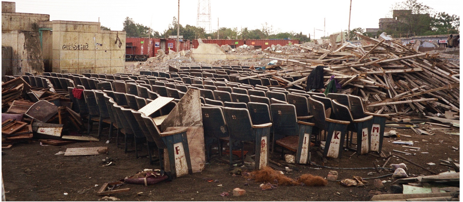
Seats removed from the damaged public auditorium in Anjar following the Gujarat Earthquake.