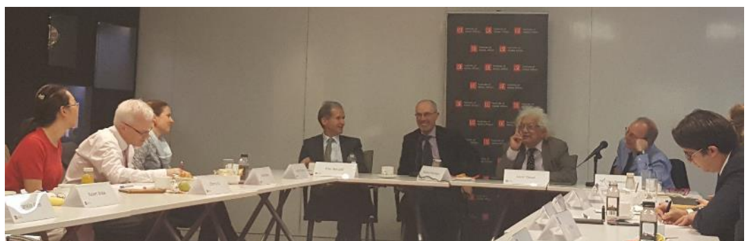
LSE IGA PowerBreakfast Series: Global leadership – by default or by design?, October 2017, LSE