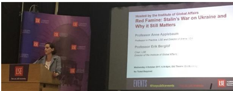
Red Famine book presentation, October 2017, LSE