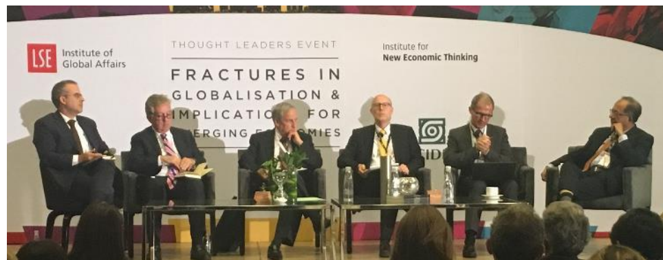
Thought Leaders Event: Fractures in Globalisation, June 2017, Mexico