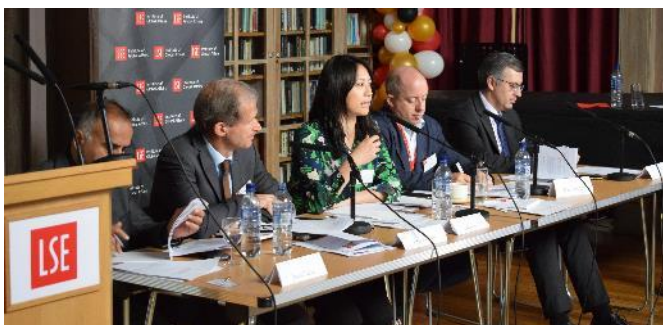
LSE Global Policy Lab launch, May 2017, LSE