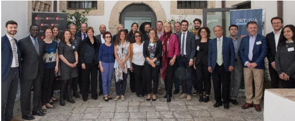
3 rd Alliance of Leading Universities on Migration (ALUM) Conference on Migration, April 2017, Siracusa, Italy