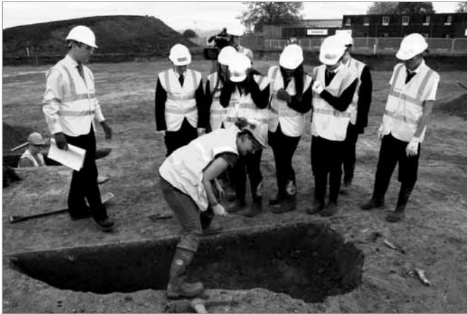
Future pupils of the All Saints Academy in Cheltenham (part of the Building Schools for the Future programme) were able to visit excavations in progress before their new school was built on the site

Many local groups are actively involved in researching and developing understanding of their local heritage. There are excellent examples of public participation, alongside commercial organisations, during and after development that demonstrate it can be one of the most treasured opportunities to take part at the cutting edge of discovery.