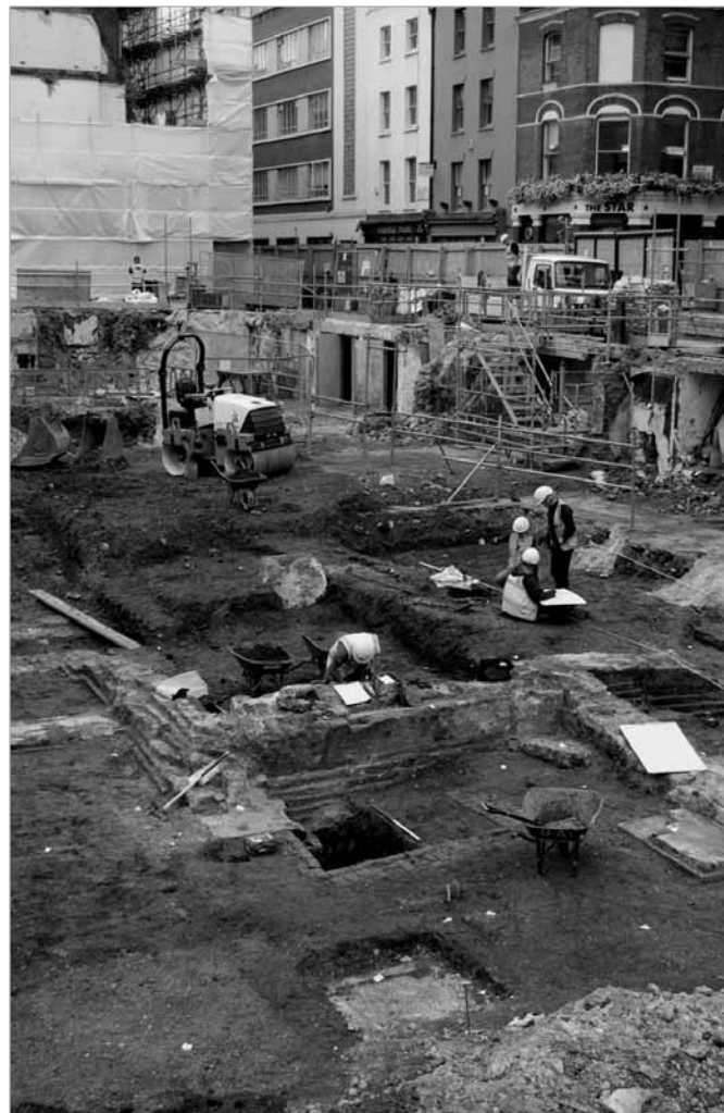
Tottenham Court Road/Dean Street excavations by Oxford Archaeology/Gifford for Crossrail