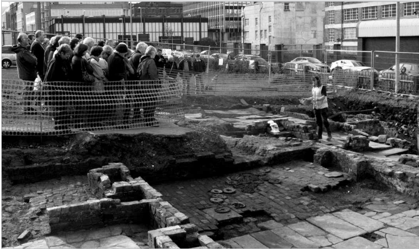
Excavation of cellar dwellings in Angel Meadow, a notorious 19th-century slum in the heart of Manchester, now redeveloped for the Co-operative Group, were part of a guided tour during a public open day

Many local groups are actively involved in researching and developing understanding of their local heritage. There are excellent examples of public participation, alongside commercial organisations, during and after development that demonstrate it can be one of the most treasured opportunities to take part at the cutting edge of discovery.