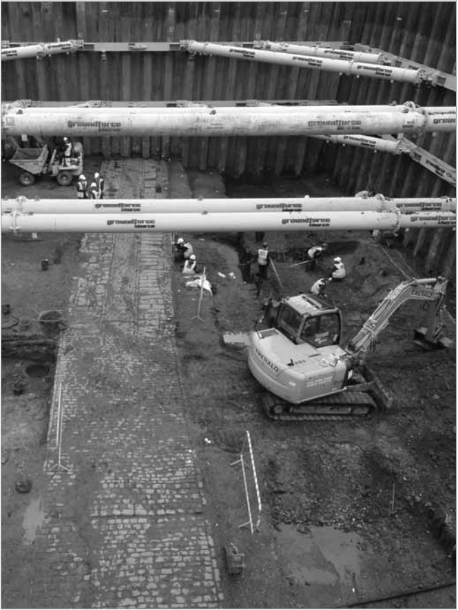
A buried Victorian street under a thick layer of made ground, typical of most of the Olympic Park area

The vision is for historic environment investigation services that deliver maximum net value to society, that weight procurement models toward quality over price, that demand adherence to standards for person, process and product and that sustain projects that produce ‘use value’ as well as ‘existence value’