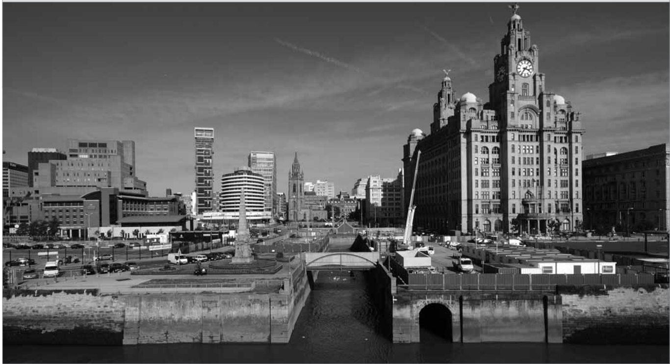
Structures forming part of the historic docks in Liverpool were investigated and recorded for a new Liner Terminal, an integral part of the overall programme of urban regeneration at the heart of Liverpool's historic waterfront within the World Heritage Site

Placing the exploration and understanding of the past – in all its variety and complexity – securely at the heart of planning-led investigation practice will delivery stronger benefits more consistently to society as a whole, and will ultimately be more rewarding too for historic environment professionals and for the property and development sector which funds their work.