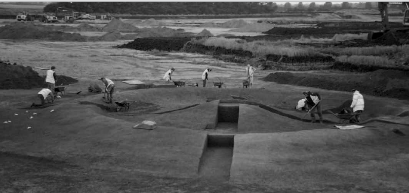
Excavation of the Low Ground Barrow Cemetery at Needingworth Quarry, Cambridgeshire. Support by Hansen Aggregates has allowed an innovative programme of investigation and research by Cambridge Archaeological Unit resulting in exceptional opportunities for re-defining various aspects of prehistory

There are excellent examples of universities and commercial organisations collaborating on research; however, the structural separation of most university and commercially-funded research organisations remains worrying and mechanisms are needed to foster partnership and share results and new thinking.