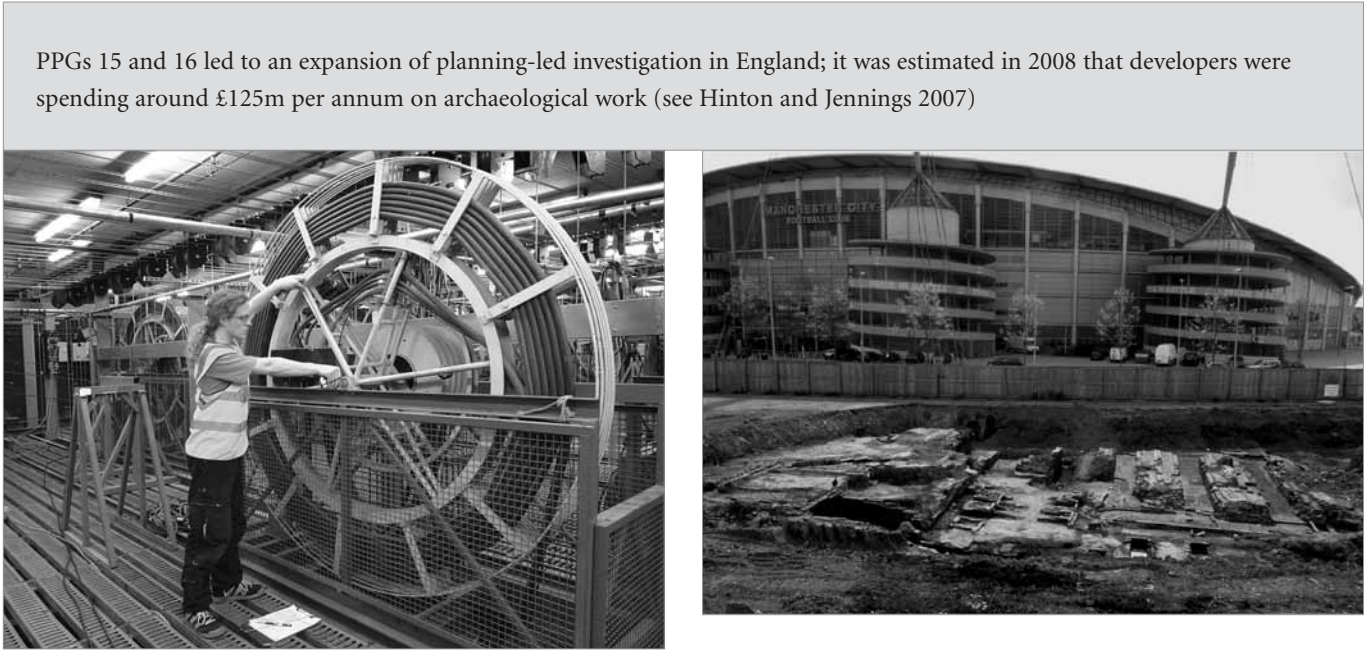
Recording the lighting grid at the Barbican Theatre