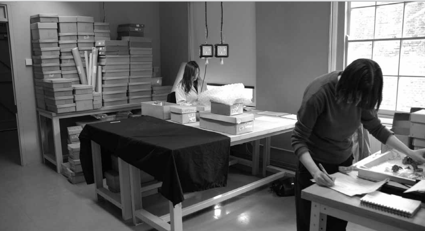
Post-graduate researchers at work with an archaeological archive

Archives inform a growing knowledge base in museums and the communities they serve; they facilitate the work of individuals, researchers, schools and other learning groups, and both enhance existing routes of enquiry (including HERs and the ADS Grey Literature Library) and open up new curiosities.