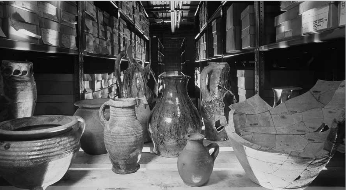
A model in the management of archaeological archives: the London Archaeological Archive and Research Centre (LAARC) provides facilities for both storage and access to historic environment archives

The vision is for a network of resource centres related to existing museum structures and supporting appropriate expertise, that curate archaeology collections (records and material) and provide wide access, in many forms, to all types of information on the historic environment for a wide variety of users