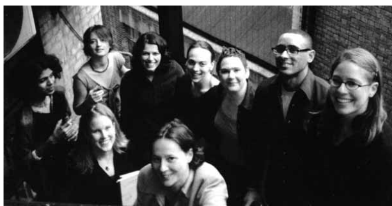
Staff, PhD and MSc student members of the Feminist Epistemologies Collective, authors of Marginal Spaces: Reflections on Location and Representation (2002)

The GI is also a place where learning through interaction and collaboration between staff, MSc and PhD students is encouraged and facilitated both inside and outside the classroom. The PhD training programme, for example, has research students reading and responding to each other's work every fortnight. Research scholars and PhD students are also invited to