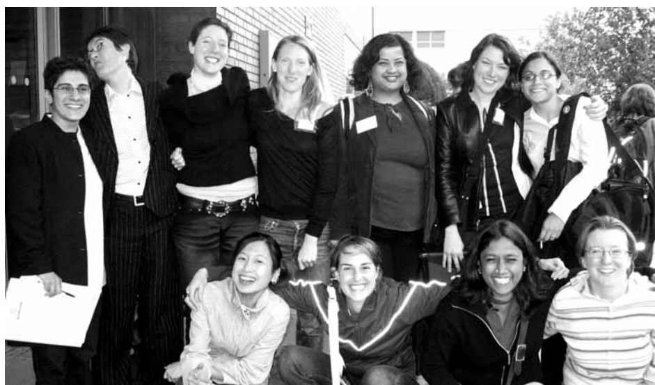
Contingent of GI students at feminist studies conference, Dublin 2004