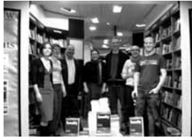
Contributors to Sexuality: The Essential Glossary (2004) celebrate their book launch at Waterstones on campus.

economy: Implications of the internet on gender relations in Thailand;' and Satako Nadamoto's on 'Gender and ICTs: Empowerment of women at cybercentres in Jamaica.'