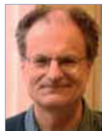
Thomas J Sargent (New York University)