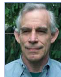
Christopher A Sims (Princeton University)