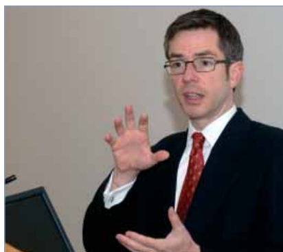
Randall S Kroszner (Member of the Board of Governors of the Federal Reserve System)