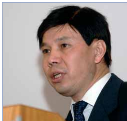
Luo Ping (Deputy Director-General, China Banking Regulatory Commission)

Asian markets, and addressed the merits of Basel II while at the same time cautioning on the convenience of implementing it in emerging markets. Finally, he discussed the current state of the policy debate on allowing entry of foreign banks.