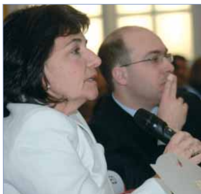
Dr Silvana Vatnick (Lead Financial Economist, Financial Sector Vice-Presidency, World Bank)

Basel II. According to him, Basel II was designed to better relate capital to risk, which is achieved by the three-pillar approach: risk based minimum capital requirements (Pillar 1); support for more risk-based supervision, and banks themselves better relating the level of their actual capital related to risk (Pillar 2); improved disclosure (Pillar 3).