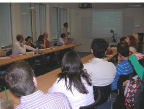
PhD Student Presentations

In the final programme we had to schedule 28 panels over the two days, to accommodate over 110 presentations by PhD students, who were speaking on topics relevant to their current doctoral research or recently completed PhDs. The participating students came from the UK, Greece, the rest of Europe, North America, and Australia. We were equally lucky to be able to draw on the high quality pool of Greek academics employed in UK universities to chair the panels and act as discussants on the papers of the student presenters. Indeed, this is one of the main ambitions of the PhD Symposium; to allow doctoral students to discuss their research questions and thesis design with established academics from different institutions who may have some expertise in their area of interest. In this way we hope to provide a forum for PhD students working in an area which may not be in the mainstream of the research community of their home institution to be exposed to debate and dialogue with established figures from other institutions and to use them as a sounding board for issues pertaining to their research.