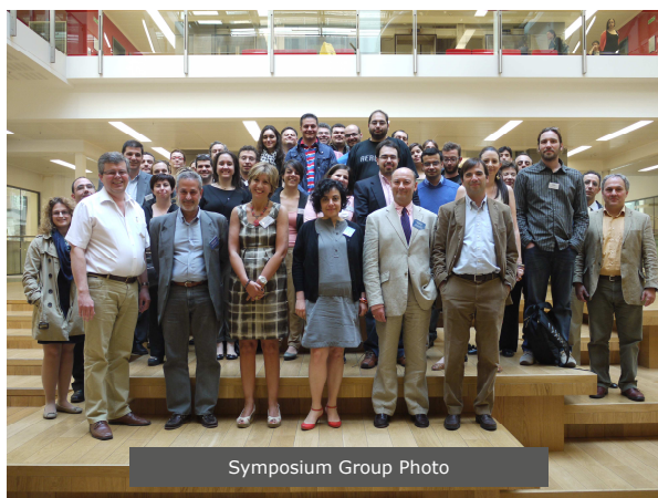
Symposium Group Photo

in the particular field. This allow for a guided discussion to offer the presenters feedback both from an informed