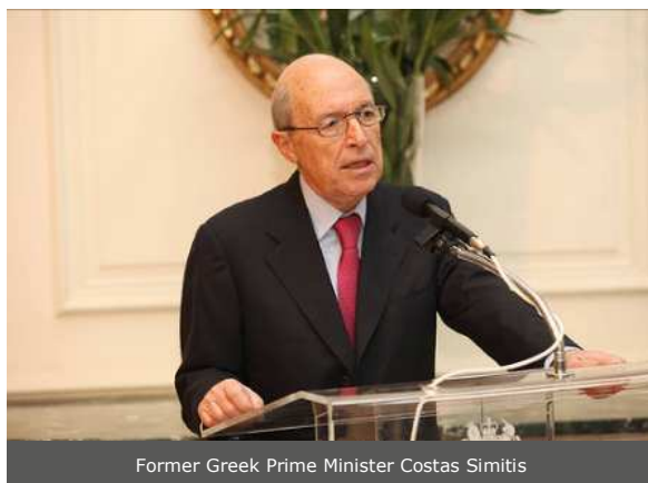
Former Greek Prime Minister Costas Simitis

A page dedicated to this event is available at http://www2.lse.ac.uk/europeanInstitute/research/hellenicObservatory/Events/Conferences/BSA_conference_2011/BSA_Conference_2011.aspx