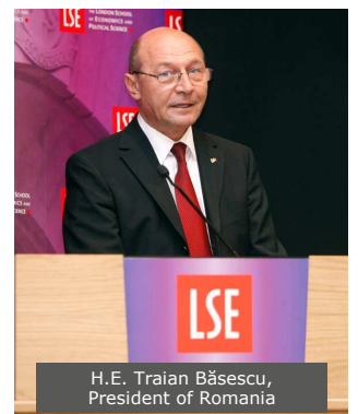
H.E. Traian Băsescu, President of Romania

deputy Prime Minister and Finance Minister and a workshop on environmental governance in the region.