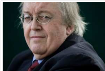
Paul Preston in 2009.

These numbers are important and shocking. But the value of Preston's book is the rich historical context he provides for them. The first four chapters cover the five Republican years (1931-36) to explain the gradual but deliberate build-up of hatred and political tensions. The bulk of the book, organized in eight central chapters, deals with the violence during the war. The long final chapter narrates the "continuation of the war by other means" during Franco's almost forty-year dictatorship, built on the conviction that only harsh punishment for the defeated, not reconciliation, could be the basis of a "healthy" and "true" post-war Spain. For decades, the country lived in the grips of a perverted justice system that branded loyalty to the Republican government as treason, and largely relied on denunciations from ordinary citizens.