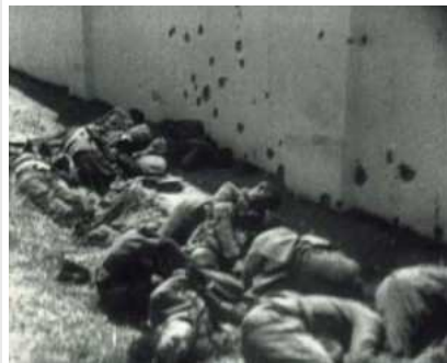
Victims the Nationalist massacre at Badajoz.

Paul Preston. The Spanish Holocaust: Inquisition and Extermination in Twentieth-Century Spain . New York: Norton, 720 pp. (Buy at Powells and support ALBA.)