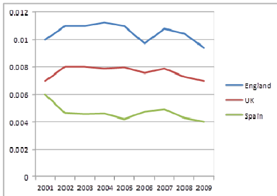
Figure 2. Regional Inequalities (unadjusted health care output)