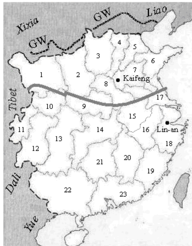
Figure 2. Geopolitical Map of Song China

Note: Along the northern border were the Khitan Kingdom (Liao) and the Tangut Kingdom (Xixia) prior to 1127. The grey line = new international border between the Jurchen Jin and the Southern Song after 1127. GW = the line where the old Great Wall had laid. Numbers represent provinces ( lu ), as in 1111 AD. Kaifeng was the capital of the Northern Song; Lin-an, that of the Southern Song.