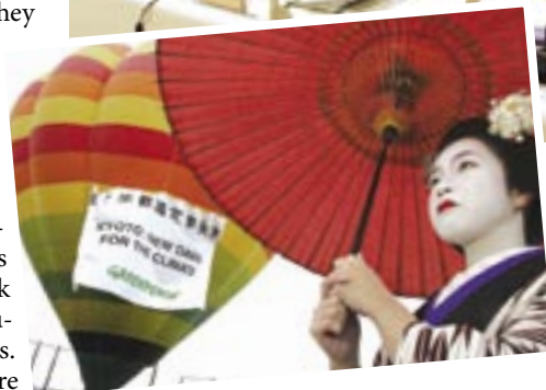
The treaty negotiated at Kyoto in 1997 has been ratified by 172 nations. Has it made a difference?

steps. However, these approaches begin to recognize the reality that fewer than 20 countries are responsible for about 80% of the world's emissions. In the early stages of emissions mitigation policy, the other 150 countries only get in the way.