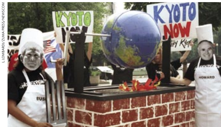
Climate villains? Protesters have called for the United States and Australia to ratify the Kyoto Protocol.