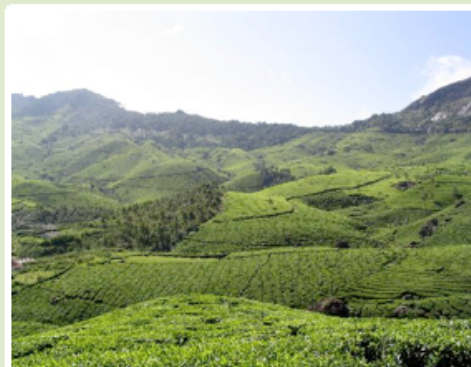
Kerala: Munnar Tea Plantation FIND OUT MORE ABOUT KERALA