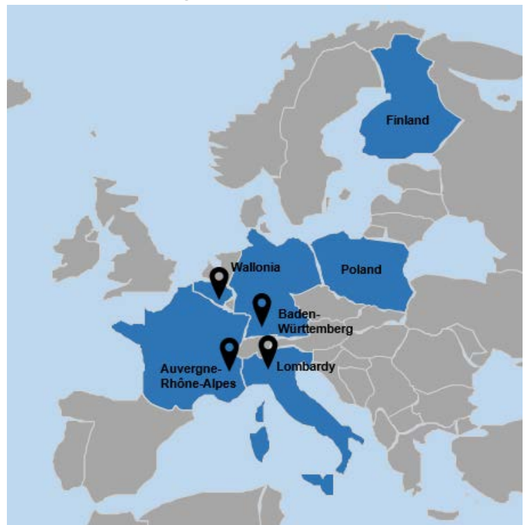
Figure 4: Map of countries and regions studied

In order to better understand how the principles of transparency and accessibility with regard to EU funds, as stipulated in EU secondary legislation, are currently being implemented throughout the European Union we have undertaken a number of case studies . Indeed, in light of the multi-level nature of the funds in shared management we have looked at different Member States and regions, but also local government in their capacity of beneficiaries of these funds, to understand how the EU legal framework is being implemented by these various levels of public authority. To this end we list the various legal requirements arising under EU law. Where we have crossed a category it means that the Member State or region do not comply with the legal requirement concerned. We also mention where Member States or regions go beyond the requirements imposed by EU law.