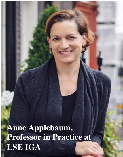
Anne Applebaum, Professor in Practice at LSE IGA