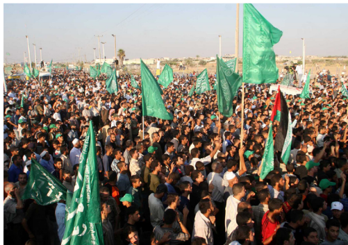
Hamas supporters demonstrate against the closure of the Rafah Border crossing.

There can be no viable, lasting peace agreement between Israel and the Palestinians if Hamas is not consulted about peacemaking and if the Palestinians remain divided with two warring authorities in the West Bank and in Gaza. Hamas has the means and public support to undermine any agreement that does not address the legitimate rights and claims of the Palestinian people. Its rival, Fatah and the PA, lacks a popular mandate and the legitimacy needed to implement a resolution of the conflict. President Mahmoud Abbas has been politically weakened by a series of blunders of his own making, and with his moral authority compromised in the eyes of a sizable Palestinian constituency, Abbas is yesterday's man.