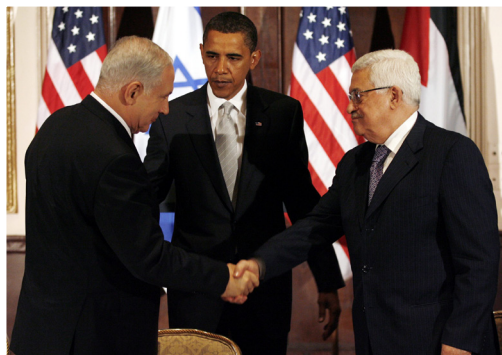
'Deal or no deal?' Benjamin Netanyahu and Mahmoud Abbas shake hands in New York.

On the basis of these statements by the Israeli Premier and his Defence Minister, it would seem that the government is inclined at least to explore the possibility of peace with the Palestinians through either a regional framework or bilateral negotiations.