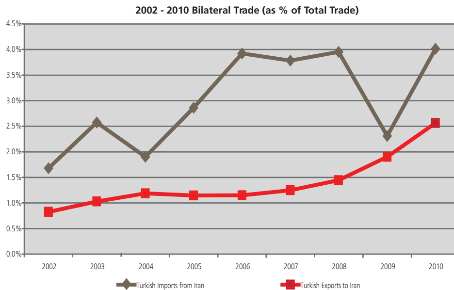
Chart 2: Turkish-Iranian Trade from 2002-2010 in as a percentage of total Turkish trade.

Data from the Turkish Undersecretariat of the Prime Ministry for Foreign Trade, found at www.dtm.gov.tr