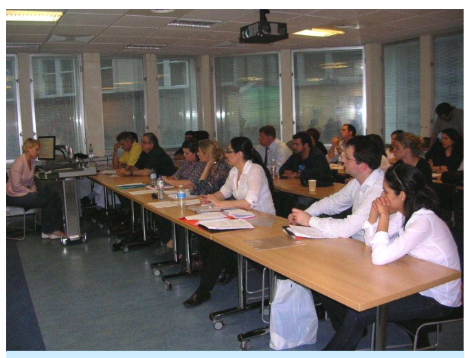
Symposium Panel Meeting

The 4<sup>th</sup> Hellenic Observatory PhD Symposium was held on 25 and 26 June and attracted over 100 paper givers from Europe and beyond. As ever the topics of PhD research were diverse and we had to divide the 27 specialist panels into 5 sessions to accommodate them all.