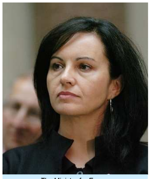
The Minister for Europe Rt. Hon. Caroline Flint MP

then followed by a question and answer session. Once again, the Minister continued to reiterate the benefits of a peace deal, and pointedly refused to engage in speculation about the possible breakdown of talks. As she noted, 'this was too good an opportunity to miss'. There is no 'Plan B' for Cyprus.