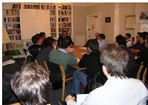
Hellenic Observatory Research Seminar