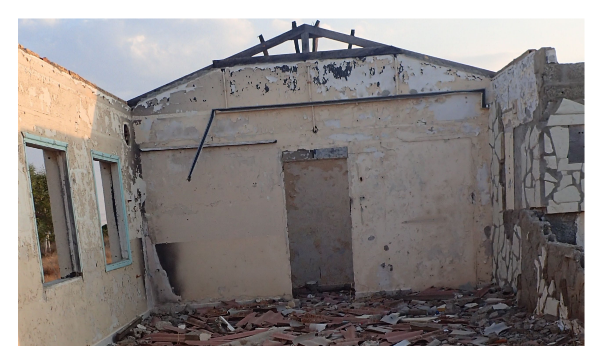
Figure 4: Ruins of the Richmond village school, 2019.