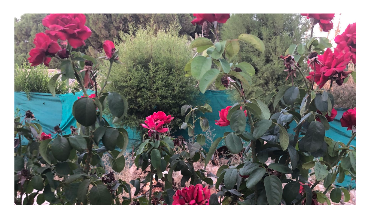
Figure 5: A garden in Richmond village, 2019. [@Author]

The legal case began when authorities of the base served eviction notices to the refugees in 2007, which prompted them to seek legal means to halt the evictions. However, the refugees had in fact been requesting transfer to the UK since 1999, giving rise to a long exchange of opinions amongst UK government departments, and embroiling UNHCR and the Republic of Cyprus (RoC) authorities in the process. In the first decade of their settlement, therefore, transfer to the UK was being requested through administrative means and through protests. It was when these means were exhausted and confrontation came to a head with the threat of eviction, that the struggle moved to the legal plane. From that point onwards, the case also attracted media interest as it progressed through the court. In this process, artists were also involved in supporting the refugees by highlighting their plight in their work.