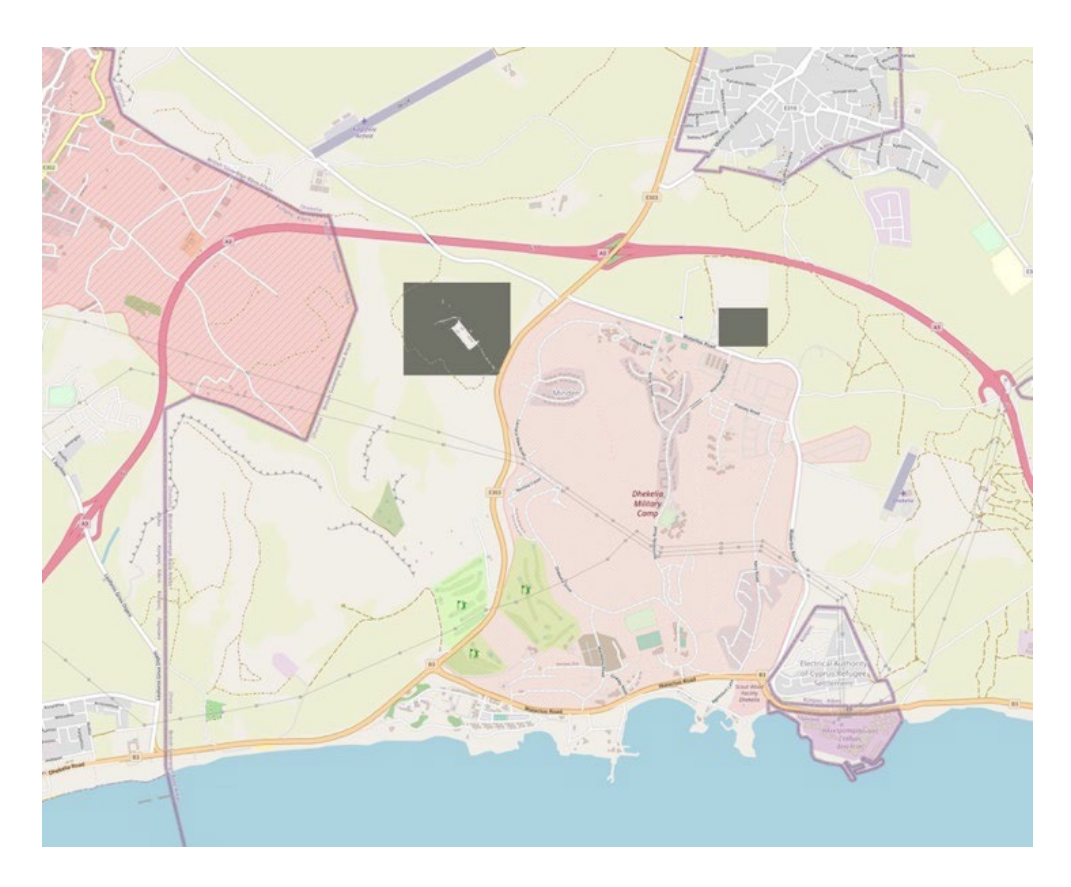
Figure 3: Richmond village (shaded box on the left) and Victoria Coach Park (shaded area on the right). Adapted from OpenStreetMap®, licensed under the Open Data Commons Open Database License [ODbL] by the OpenStreetMap Foundation [OSMF].