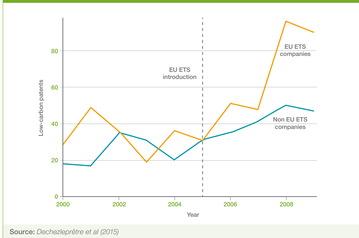
Figure 3. Low carbon innovation activity of regulated companies in the European Union Emissions Trading System compared with comparable companies outside the System

While the EU emissions trading system (EU ETS) has had no measurable negative impact on business competitiveness (see section 3.2), it has increased innovation activity (based on the number of patents filed) in low-carbon technologies among regulated firms. Figure 3 shows that this effect was most marked in 2007-2008 when the market price of emissions permits in the EU ETS was around €30 per tonne (Dechezlepretre et al. , 2016).