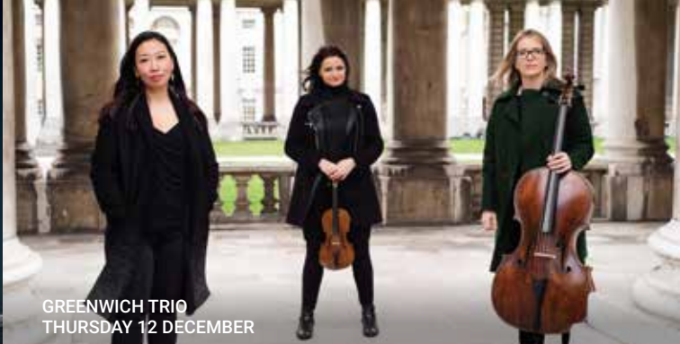
GREENWICH TRIO THURSDAY 12 DECEMBER