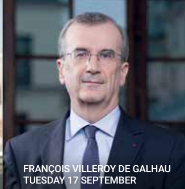
FRANÇOIS VILLEROY DE GALHAU TUESDAY 17 SEPTEMBER