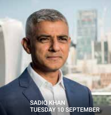
SADIQ KHAN TUESDAY 10 SEPTEMBER