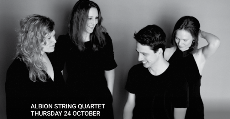
ALBION STRING QUARTET THURSDAY 24 OCTOBER