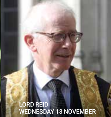
LORD REID WEDNESDAY 13 NOVEMBER

From data collection to privacy perception, discover how authoritarian regimes – such as modern-day China – are advancing the frontiers of technology, innovation and artificial intelligence. #LSEDespoticData