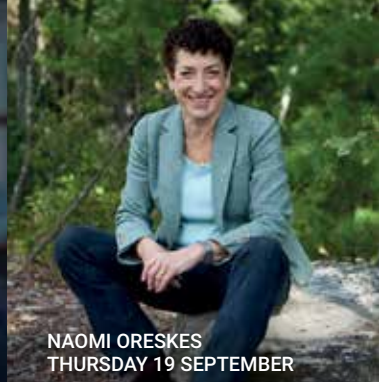
NAOMI ORESKES THURSDAY 19 SEPTEMBER