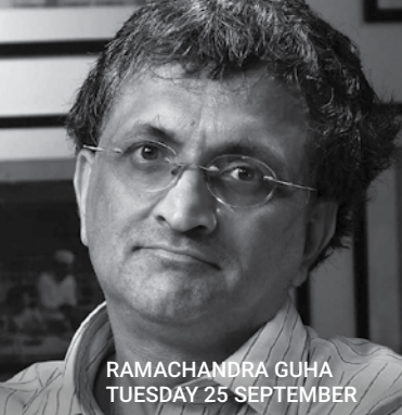
RAMACHANDRA GUHA TUESDAY 25 SEPTEMBER