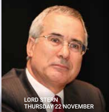
LORD STERN THURSDAY 22 NOVEMBER