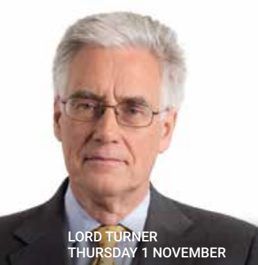
LORD TURNER THURSDAY 1 NOVEMBER