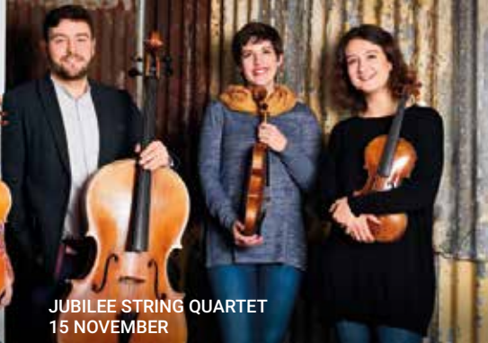
JUBILEE STRING QUARTET 15 NOVEMBER

Programme: Beethoven Sonata No. 8 in G Major, Op. 30 No. 3, Ysaye Solo Sonata No. 1 in G Minor (two movements), Prokofiev 5 Melodies, Op. 35a Saint-Saëns Introduction and Rondo Capriccioso, Op. 28.