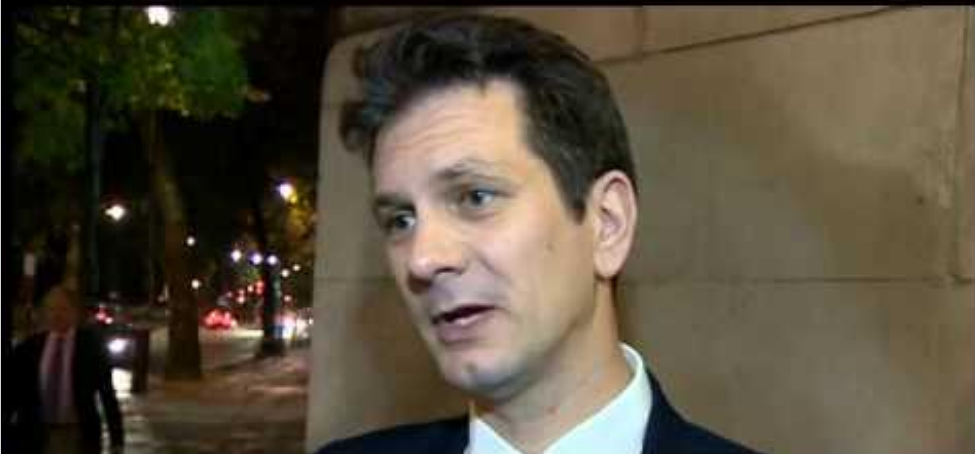
STEVE BAKER MP Vote Leave campaign