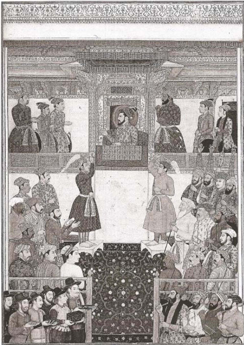
Figure 4.2: 'Europeans Bring Gifts To Shah-Jahan'

On the other hand, it is doubtful that such animals were either as strongly demanded or likely to survive (relative to those transported by land), save be traded by the English. First, Roe notes the persistence with which Jahangir requested that an English horse be sent to him, for both