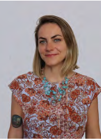
Sustainable Urban Development Specialist United Nations Human Settlements Programme (UN-Habitat) Bissau, Guinea-Bissau