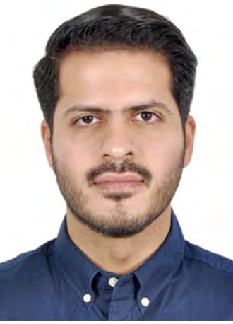
General Manager of Strategy & Research Architecture & Design Commission Riyadh, Saudi Arabia