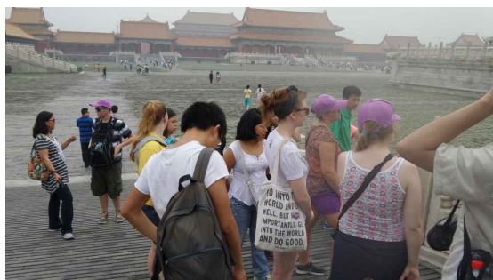
Forbidden City in Beijing